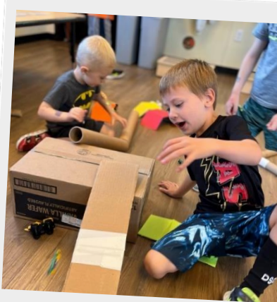
Sculpting Imagination into Reality