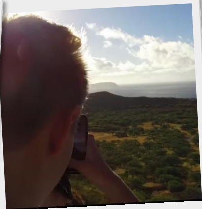
Expand your horizons