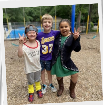
Creating Lifelong Friendships