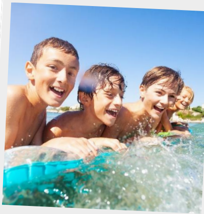
Creating lifelong friendships